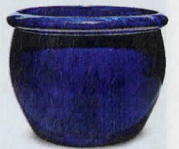
Cauldron Pot in Blue, $220, available through Charlie Thigpen's Garden Gallery; 205/328-1000