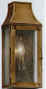
Beacon Hill, $386; troy-lighting.com for retailers

PRODUCTS, FROM TOP: COURTESY HOUSE OF ANTIQUE HARDWARE; HECTOR SANCHEZ; COURTESY SIGNATURE HARDWARE; COURTESY TROY LIGHTING