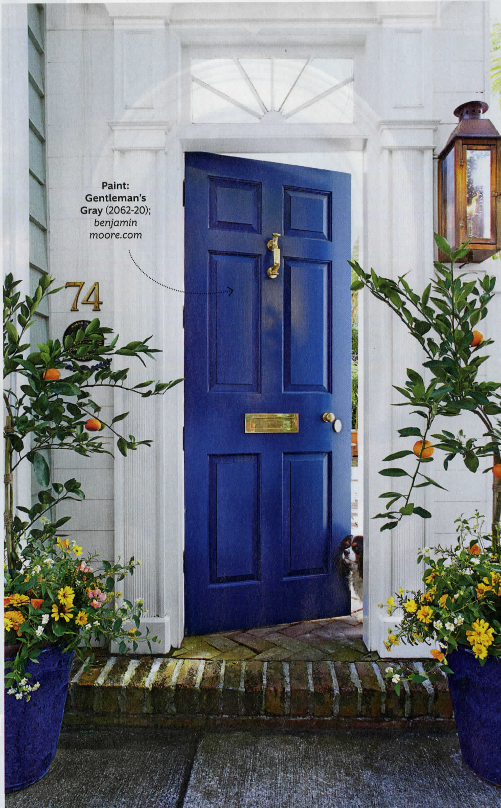
Paint: Gentleman's Gray (2062-20); benjaminmoore.com

THE CONTAINERS: Liven up the look with plants in complementary colors. “The beautiful blue door, surrounded by crisp white architecture, made me long for a zesty contrast,” Heather says. She flanked the door with satsuma mandarin topiaries for a fresh splash of orange. Large, sapphire-glazed ceramic pots offer a nice boost and tie back to the door’s bold shade. Zinnias, lantanas, and cosmos in citrusy hues pour out of the pots.